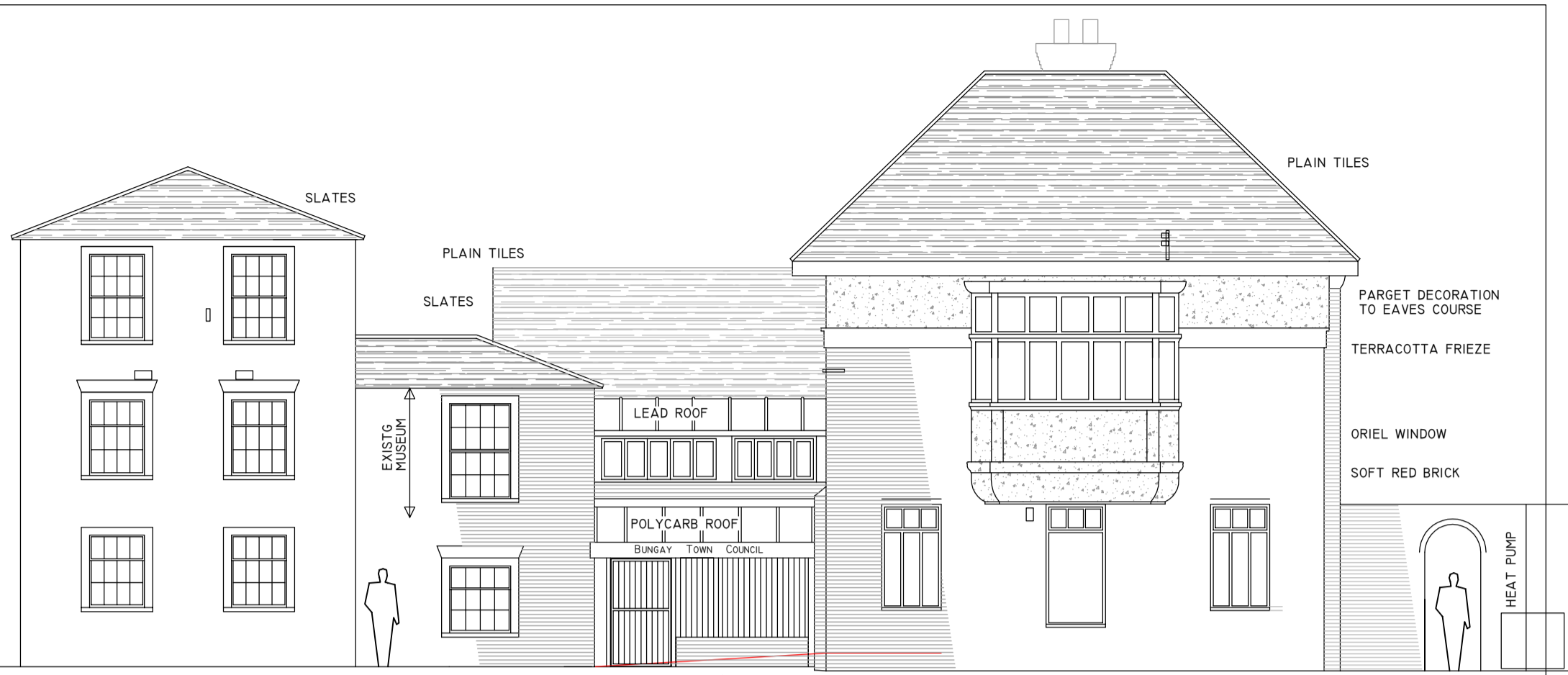
EXISTING STREET ELEVATION (EASTERLY)