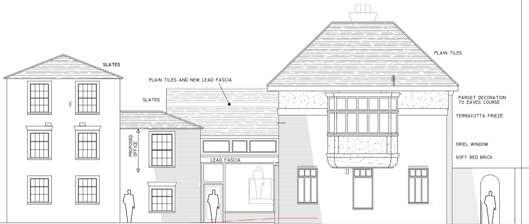
PROPOSED STREET ELEVATION (EASTERLY) BACK ELEVATION (NO CHANGE)